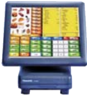
15" Display Option, Landscape