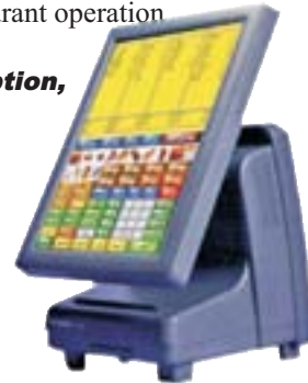
15" Display Option, Portrait